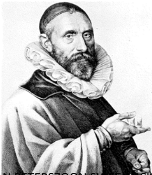
JAN PETERSZOOM SWEELINCK